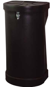
Transport case for one or two units