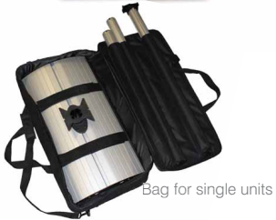
Bag for single units